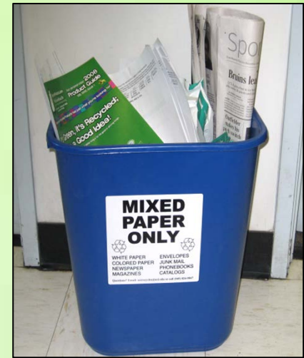
Desk-side bins for Mixed Paper

UCI students decorated classroom Commingled Recycled bins to help bring awareness about the recycling program to the campus community.