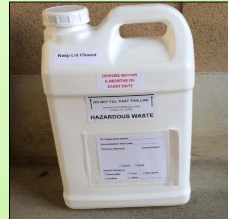
These containers are used for Hazardous Waste