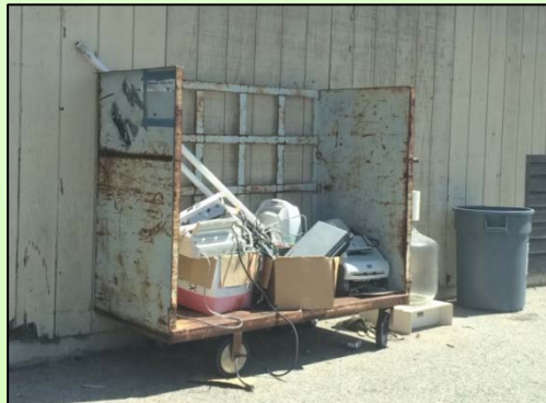
Peter's Exchange handles any E-Waste we have on campus