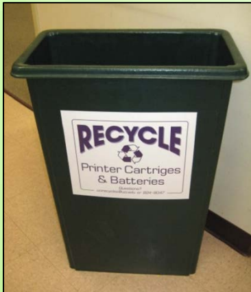
Green bins are used for Batteries and Printer Cartridges