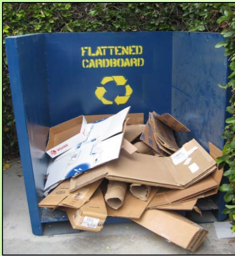
Cardboard collection station

UCI has many different kinds of bins that we use to safely contain all types of materials!