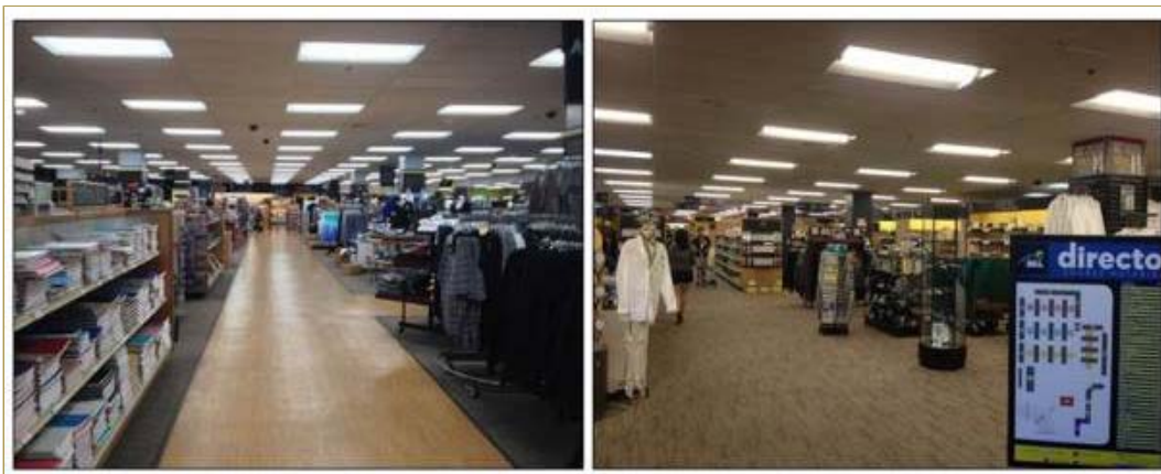
Student Center Book Store

Facilities Management and Student Affairs have partnered to upgrade the lighting at the UCI Student Center. The lighting project significantly reduces electricity use while simultaneously increasing the amount and quality of lighting throughout the building. The project supports UC Irvine's 2025 climate neutrality goal by reducing greenhouse gas emissions from campus